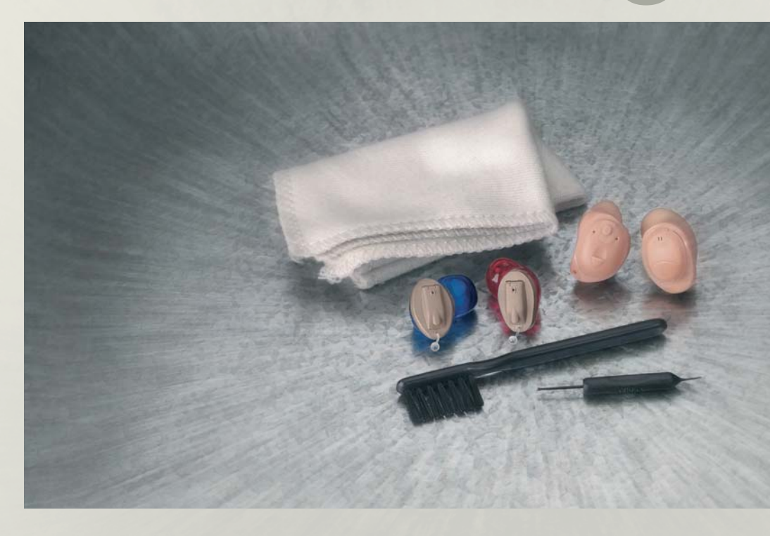
Some brief advice on how to maintain and clean CIC and ITE hearing aids